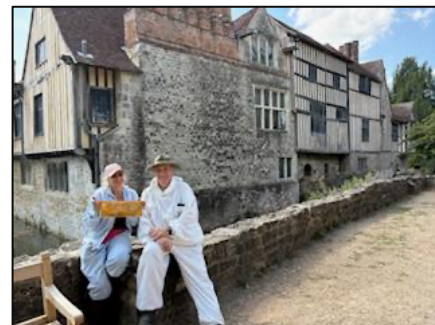
Examining a honey frame at Ightham Mote